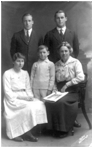
The Liddell Family in 1920. Back Row: Eric, Rob Front Row: Jenny, Ernest, Mrs Liddell

"But he was a liberal really. I was told a story that when he was in the POW camp he helped a prostitute put up some shelves in her room and she told him it was the first time a man had done something for her without asking for anything in return. But to him she was a person, a human being in need of a helping hand. He was never judgmental; in fact he was ahead of his time.