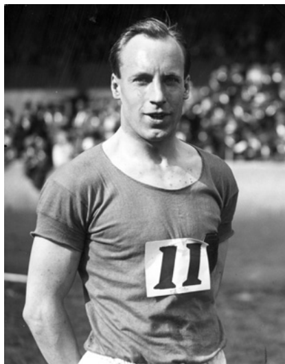
Eric Liddell at the 1924 Paris Olympics